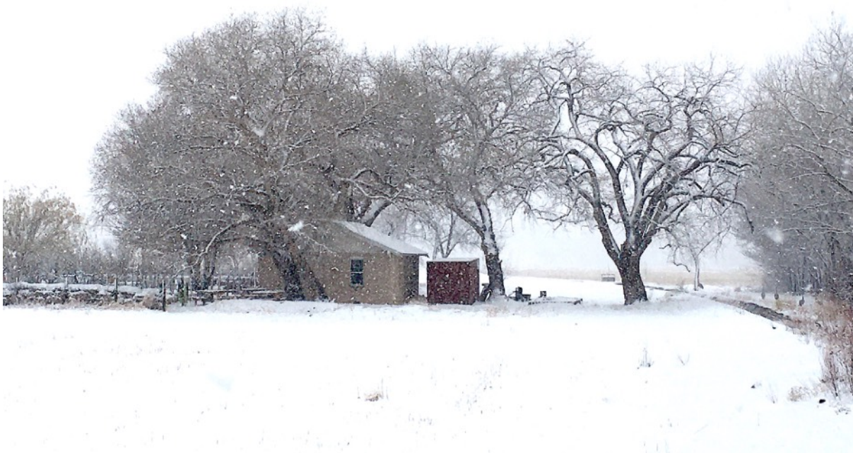
The Woodward House (From 2022, I think)